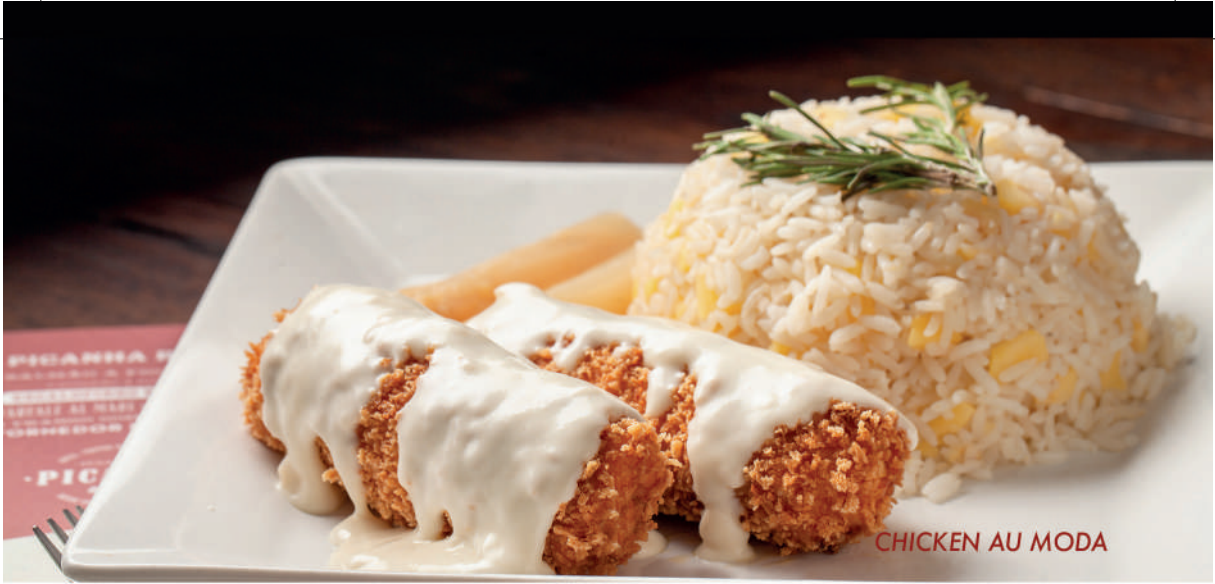
CHICKEN AU MODA